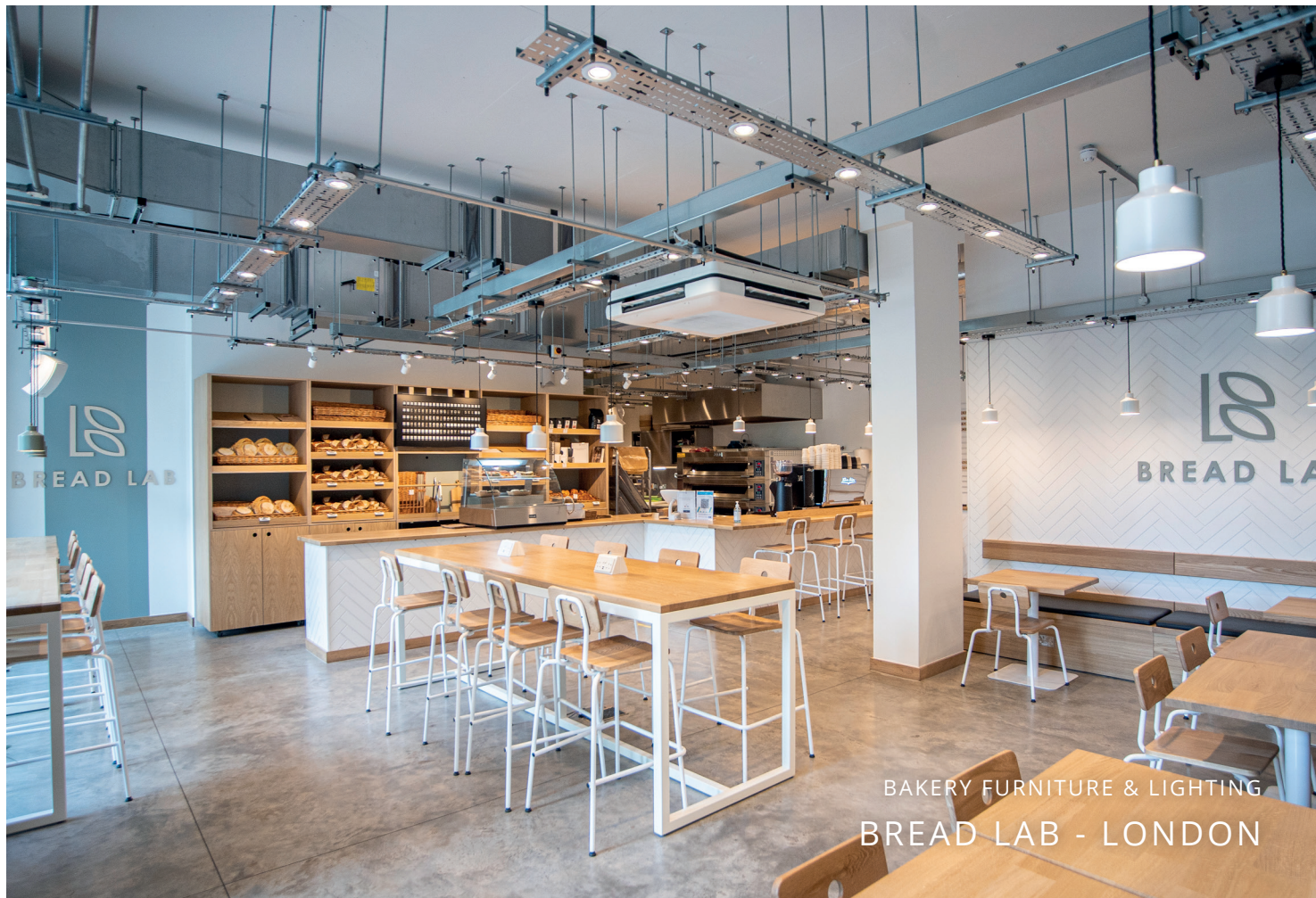
BAKERY FURNITURE & LIGHTING BREAD LAB - LONDON