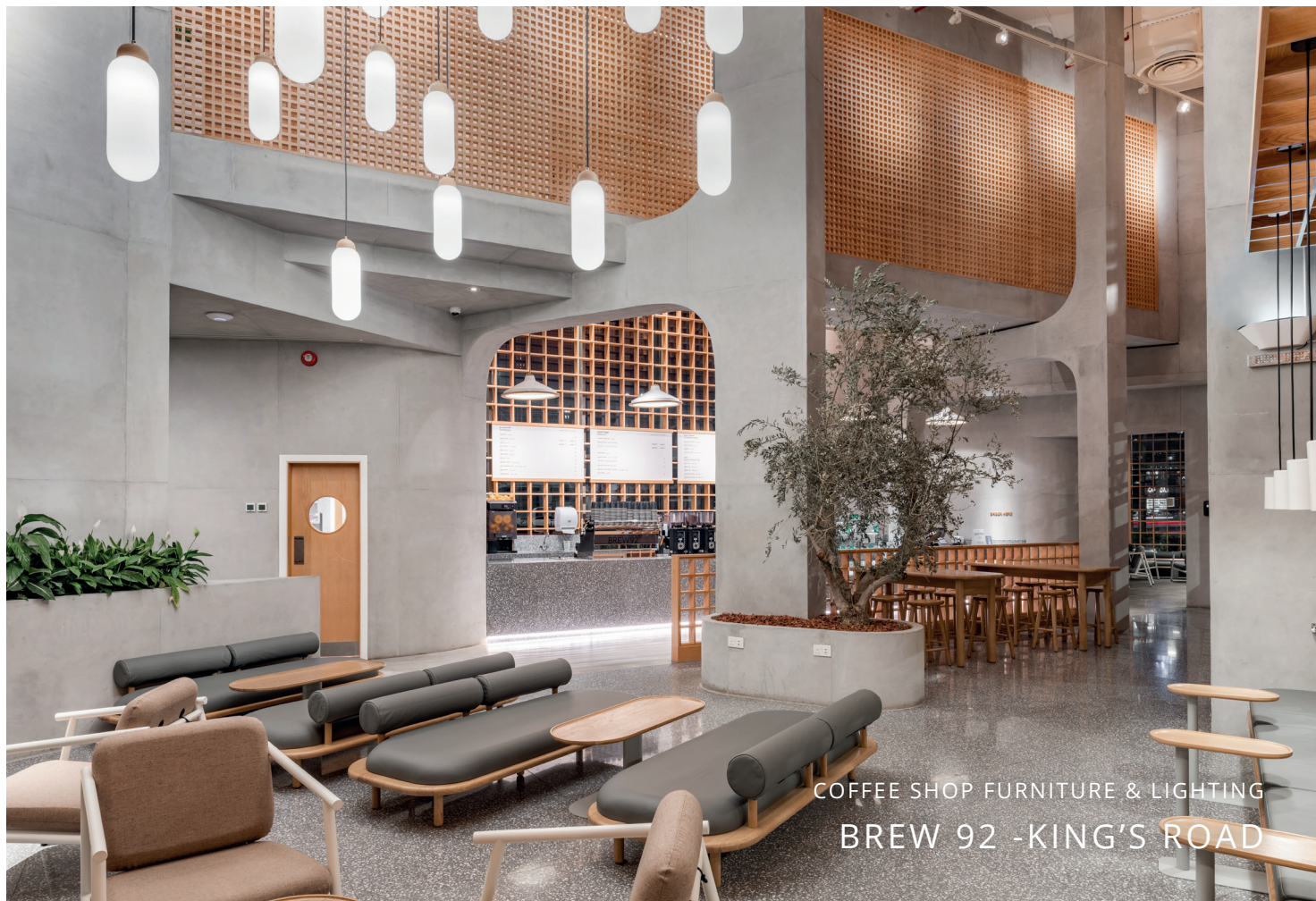
COFFEE SHOP FURNITURE & LIGHTING BREW 92 -KING'S ROAD