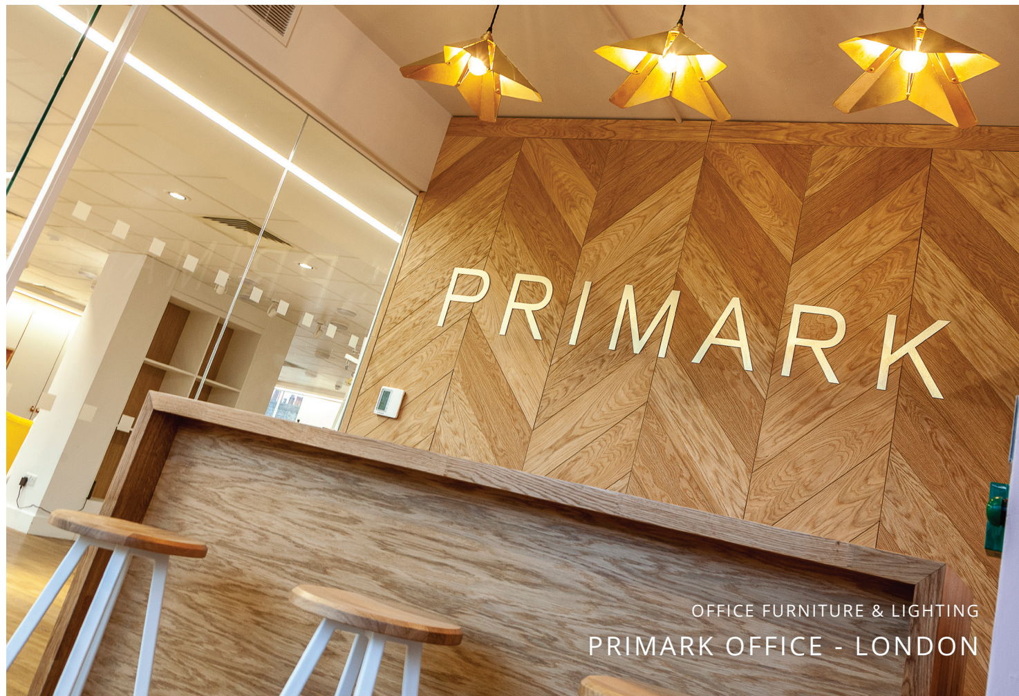
OFFICE FURNITURE & LIGHTING PRIMARK OFFICE - LONDON