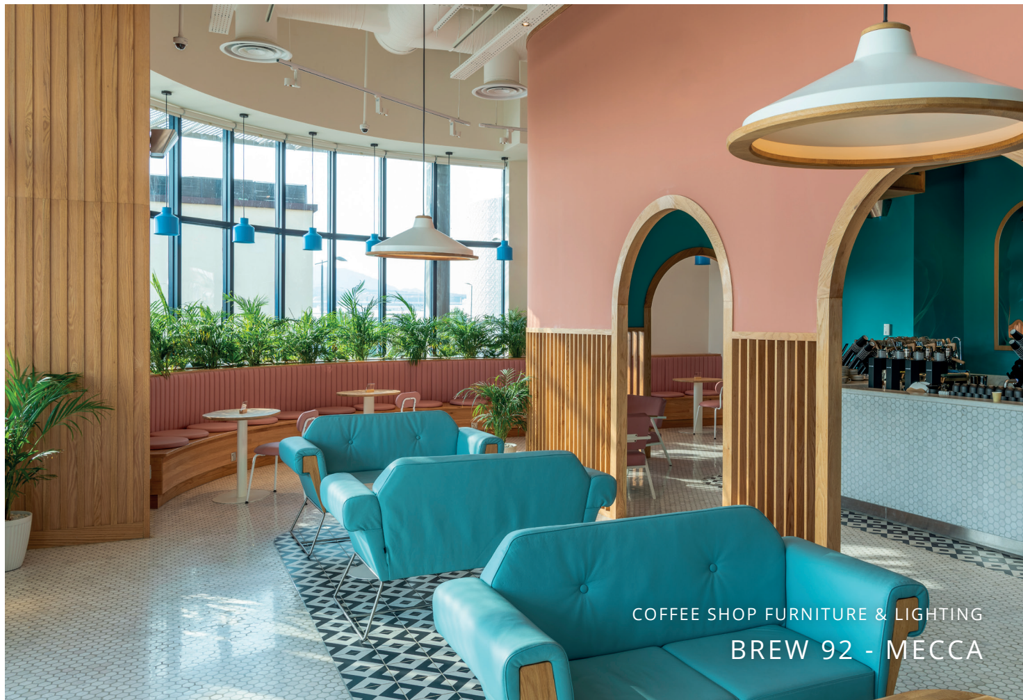
COFFEE SHOP FURNITURE & LIGHTING BREW 92 - MECCA