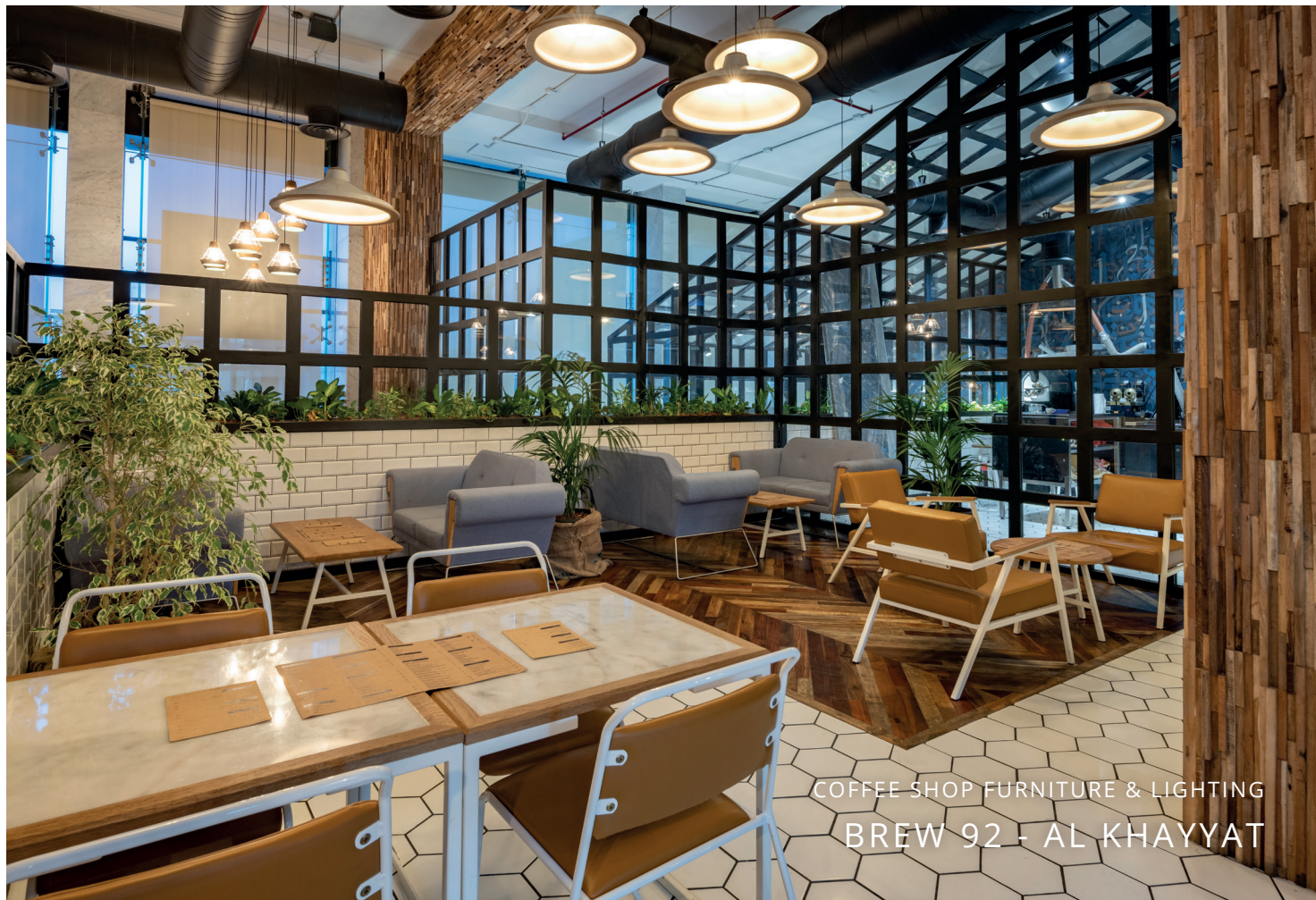
COFFEE SHOP FURNITURE & LIGHTING BREW 92 - AL KHAYYAT